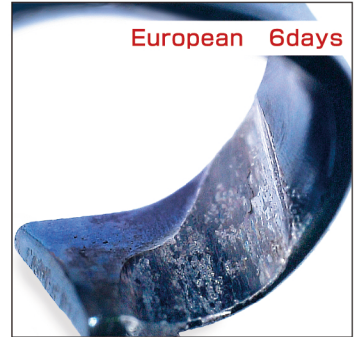
CD Ne20, TR : 1/0, Ring 38mm, SP : 17,700rpm