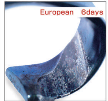
CD Ne20, TR : 1/0, Ring 38mm, SP : 17,700rpm